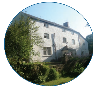
Church Farm Guesthouse