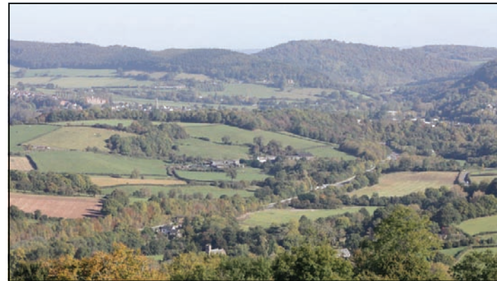
View of Monmouth with St Michaels Church, Mitchel Troy

Continue down a third field to a stile with two waymarks