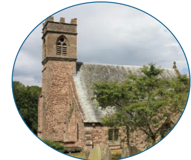
Church of St Michael and All Angels